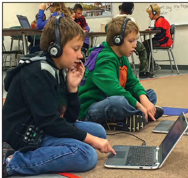
4th graders explore Spanish using technology

Another exciting aspect of the new program is the integration of new resources, starting in our introductory and level I classes and continuing next year in the remaining levels. Class sets of Google Chrome Books were purchased for the classrooms as well as new textbooks which combine traditional and progressive learning models to help teach our students the 21st century skills needed to become global citizens of an ever-connected world.