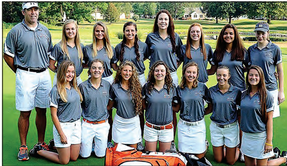
Girls Golf Team