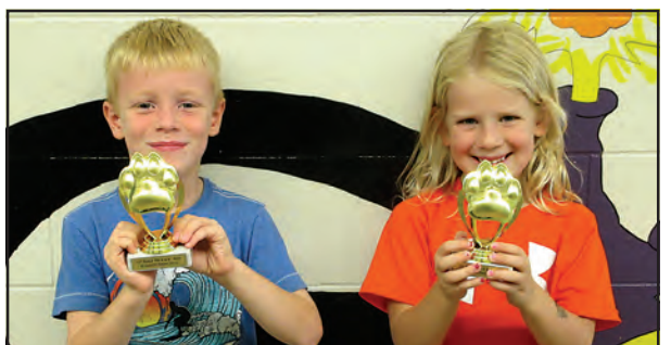
Greenwood's winners in the Bulldog Dash 5K.