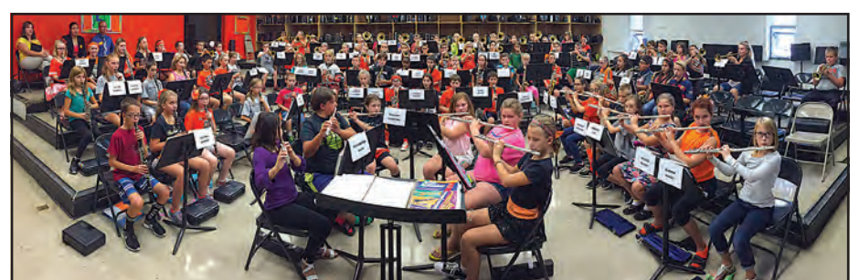
Students in 5th grade band trying out their instruments for the first time.

"Kid President." Kid President shares his positive and encouraging leadership messages via YouTube and through his popular book called Kid President's Guide to Being Awesome. All socks collected