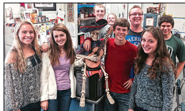
GHS Spanish IV class