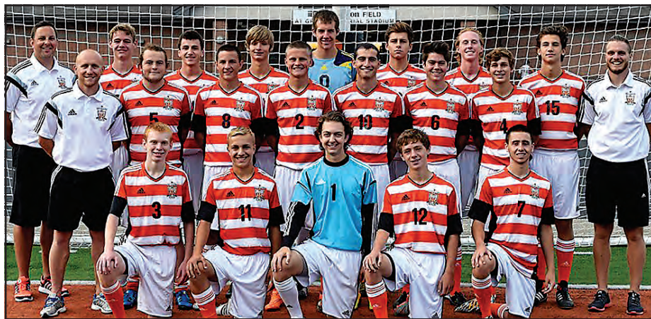
Boys Soccer Team