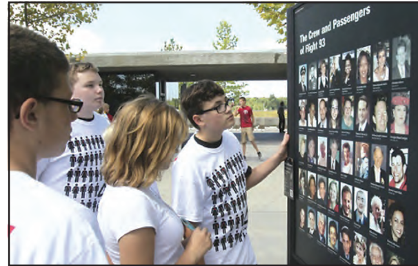
Flight 93 National Memorial – Thanks to the generosity of the HALO Foundation, students from GMS made a trip to the Flight 93 National Memorial. The students took part in a special ceremony to honor those who lost their lives on September 11th, 2001.

11 to take part in a ceremony honoring those who lost their lives on Flight 93. Thanks to the Halo Foundation and Acme Fresh Market, the stu-